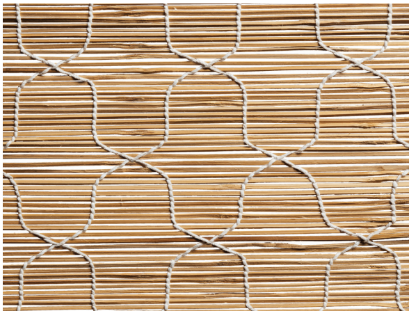
CW90 Bambosa Cream