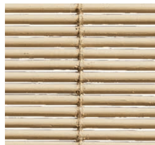
CW74 Sierra NEW PG2