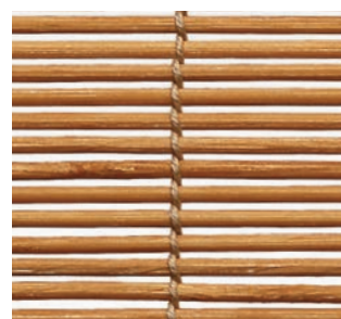
CW45 Bolivian Maple PG1