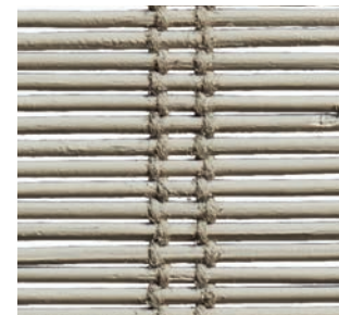
CW73d Zion NEW