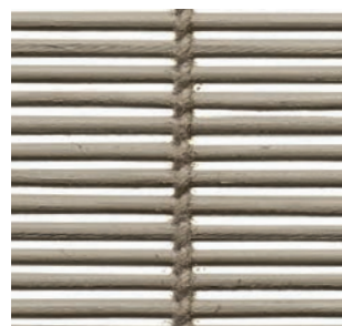
CW72 Stone PG2