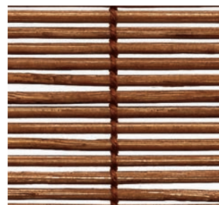
CW47 Brazilian Teak PG1