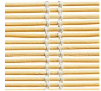
CW00d Natural NEW

A handcrafted double warp updates this traditional weave to a clean contemporary aesthetic. Woven with sustainably sourced bamboo, this design makes a crisp architectural statement.