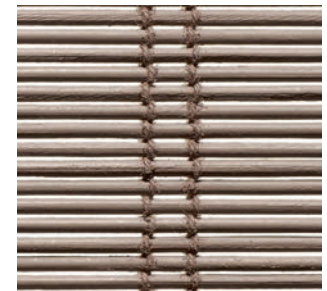
CW36d Park Avenue