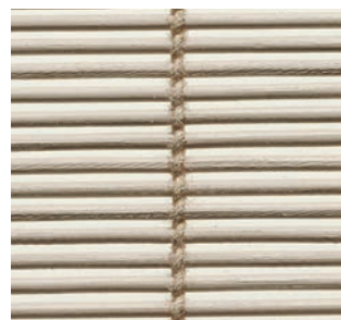
CW71 Sand Dune PG2