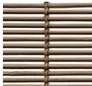
CW36 Park Avenue PG2