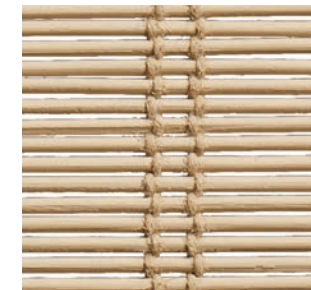
CW74d Sierra NEW