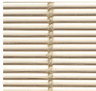
CW09 Sand Dollar PG2