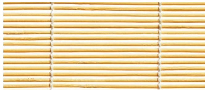
CW00 Natural NEW PG2