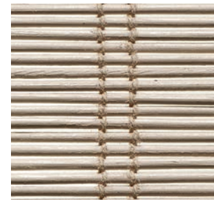
CW71d Sand Dune