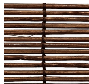
CW46 Peruvian Walnut PG1