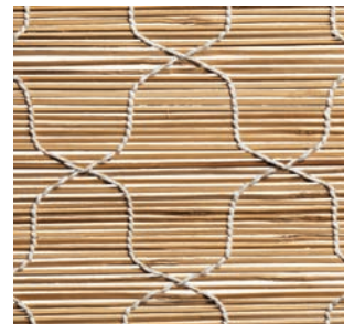
CW90 Bambosa Cream NEW

Rough-hewn bamboo splits in their natural state are artfully hand cross-threaded with a Mughal motif in creamy threads, creating a well-traveled aesthetic. This boldly textural design not only celebrates but elevates the imperfect beauty of natural materials.