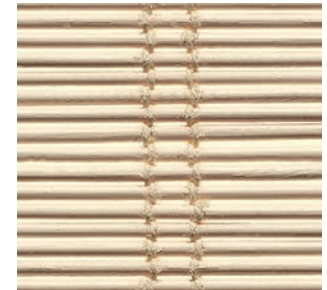
CW09d Sand Dollar