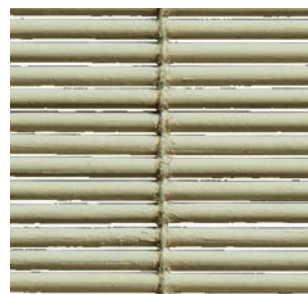
CW75 Citron NEW PG2