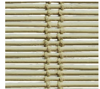
CW75d Citron NEW

Price Group: 2 | Max Width: 120" Available Styles: Roman, Top Treatment