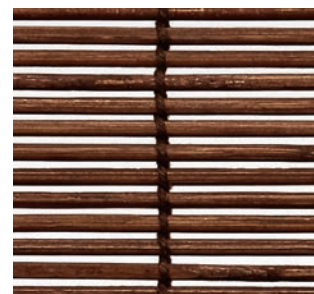
CW48 Chilean Cherry PG1