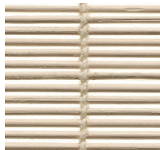
CW29 Quartz PG2