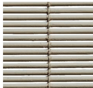
CW73 Zion NEW PG2