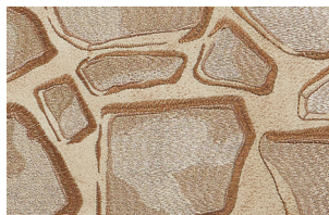
WLLK48-18 Rocks – Topaz