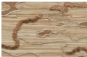
WLLK49-18 Marsh – Fawn