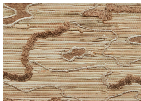
WLLK49-18 Marsh – Fawn