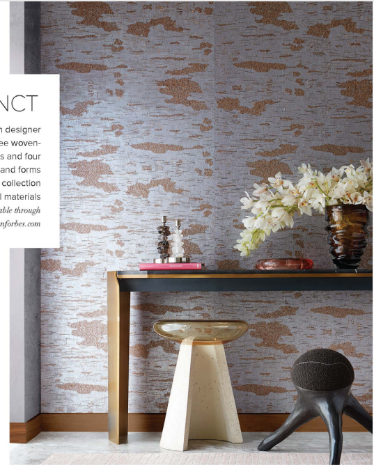
Left Behind Kanning is the Marsh design in Fawn. Above The Birch wallcovering in Wisteria.