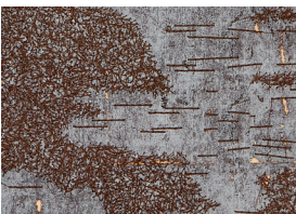
WLLK46-34 Birch – Wisteria