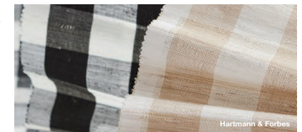
Hartmann & Forbes