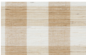
LEMH500-21 Gingham - Gold