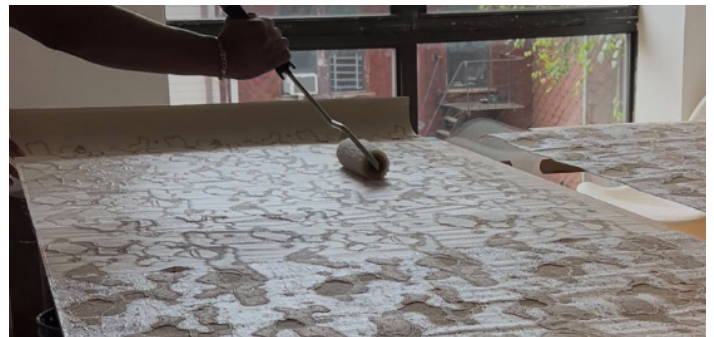
④ Apply appropriate paste evenly, especially near edges, to the back of the wallcovering, taking care not to get adhesive on face of wallcovering. Allow wallcovering paste to become tacky prior to hanging – timing will vary depending on the temperature and humidity of the room.