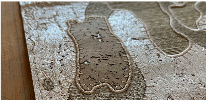
③ Leaving a finished edge