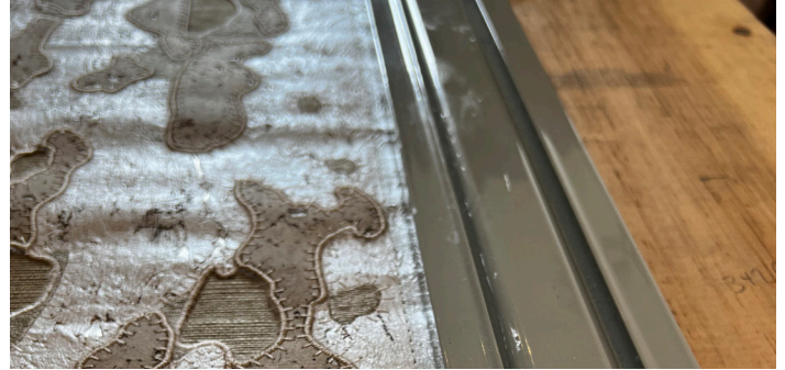
② Using a sharp cutting blade, trim 1/8"-1/4" from vertical stitching