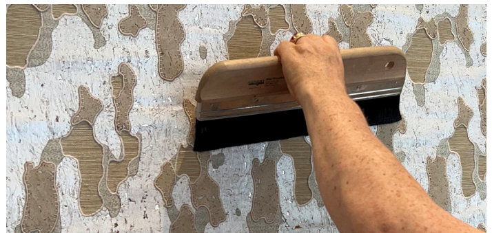
⑥ Using a brush or roller, smooth out the wallcovering as it adheres to the wall.

If you have any questions before, during or after installation, please contact Customer Relations at 888.582.8780 or at hfcr@hartmannforbes.com