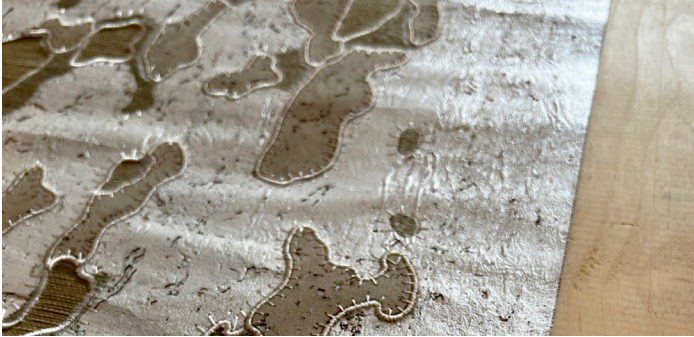
① Sycamore has a selvage edge and will need to be trimmed.