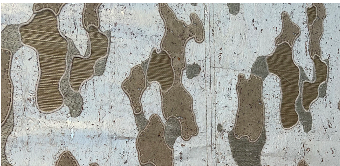
⑤ Align pattern as you hang wallcovering with panels side-by-side, noting the "TOP" of each panel.